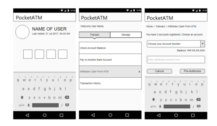
Figure 2: Screenshots of the proposed updates to Internet Banking application

PocketATM: Understanding and Improving ATM Accessibility in India